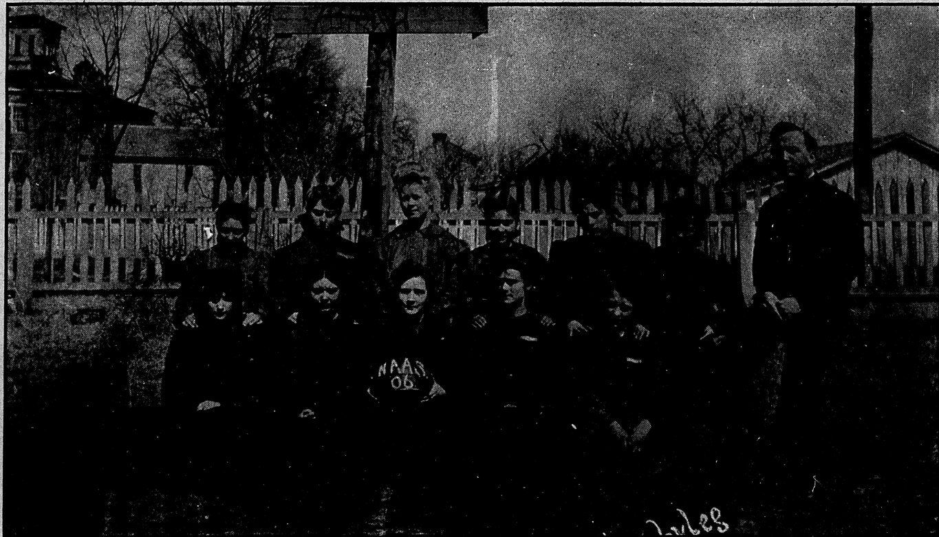
AGRICULTURAL SCHOOL BASKET BALL TEAM.