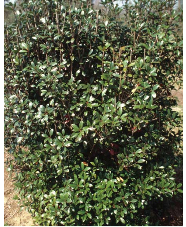
Big Foot Cleyera