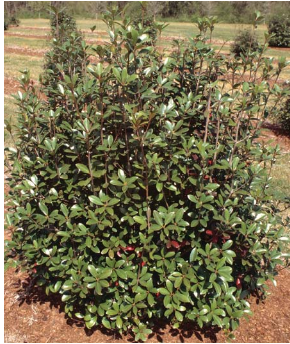
Big Foot Cleyera