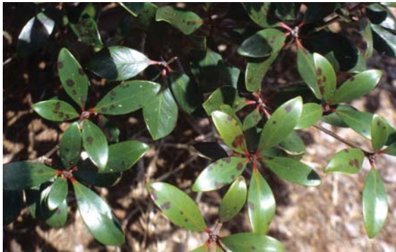
Cercospora leaf spot on a 'seedling' cleyera