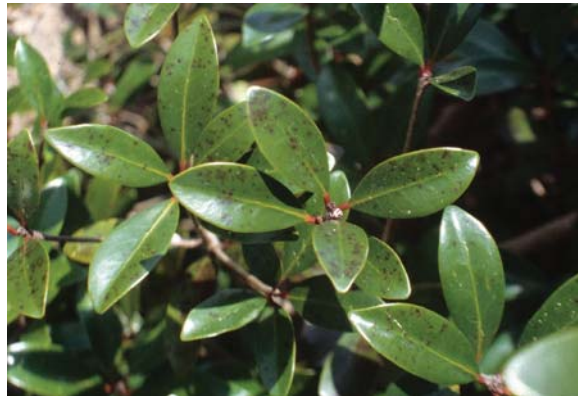
Physiological leaf spotting on Big Foot Cleyera