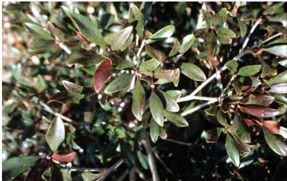
Physiological leaf spotting on Bronze Beauty Cleyera