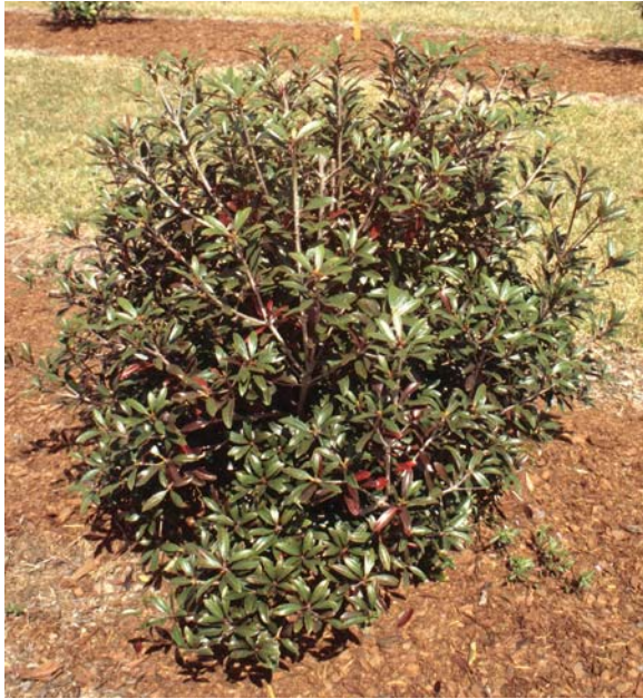
Bronze Beauty Cleyera