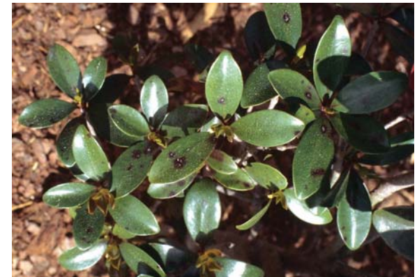
Cercospora leaf spot on a 'seedling' cleyera