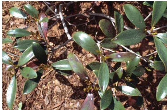
Leaf spotting and premature leaf loss on a 'seedling' cleyera