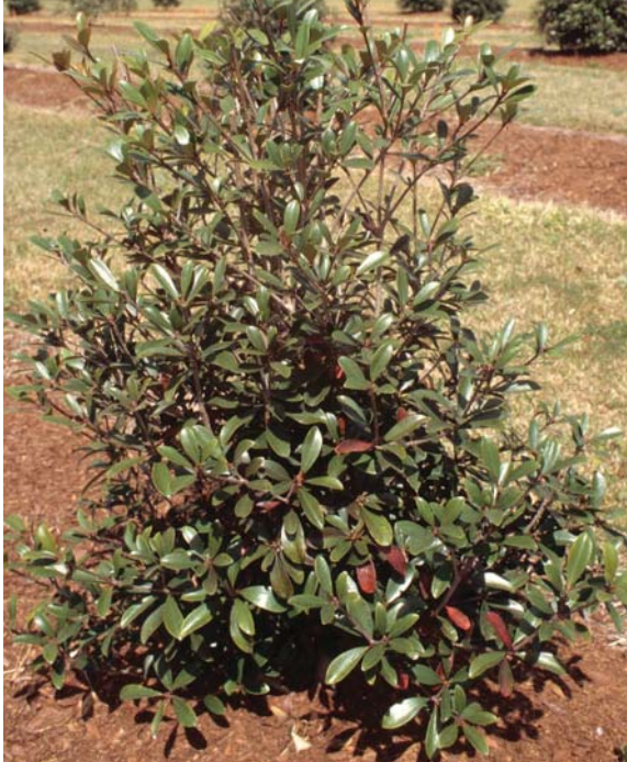
Copper Crown Cleyera