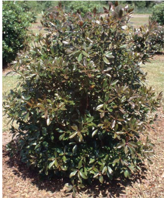
Copper Crown Cleyera