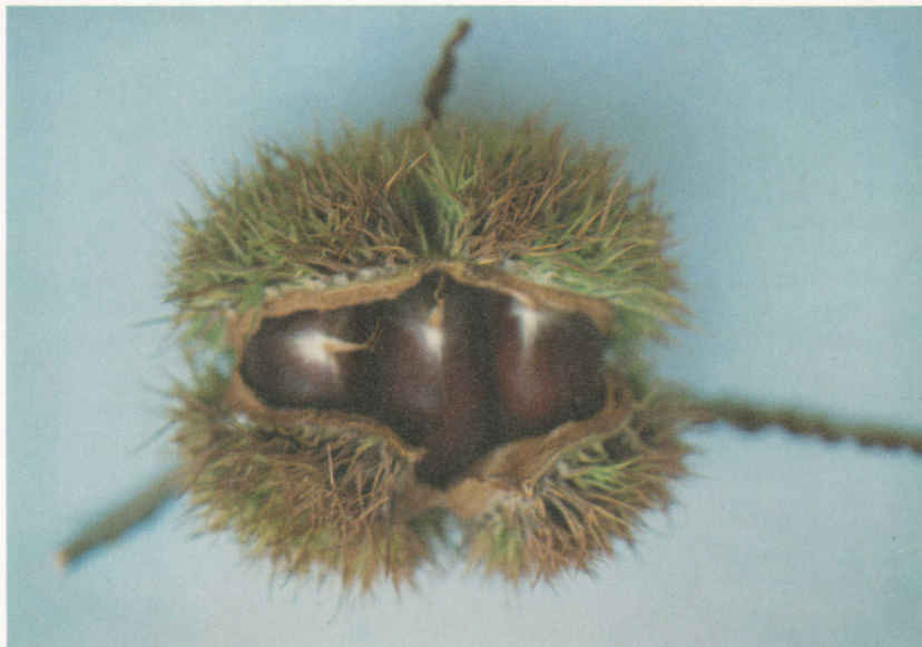
FIG. 3. AU-Homestead (Chaung Hwa).

brown 5YR 3/3) overlain with a grayish pubescence which turns white near the apex (figure 3). The nut is darker and more glossy than AU-Cropper and AU-Leader. The large burr contains two to three nuts with fair separation of the nuts from the burr (table 2).