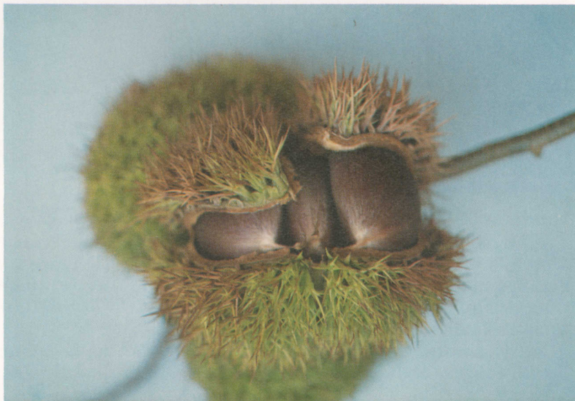
FIG. 2. AU-Leader (Ding How Li).

3 Burr opening and nut shed: 1 = excellent, burr opens well and nuts shed well; 2 = fair, burr opens fairly well; and 3 = poor, many burrs drop without opening.