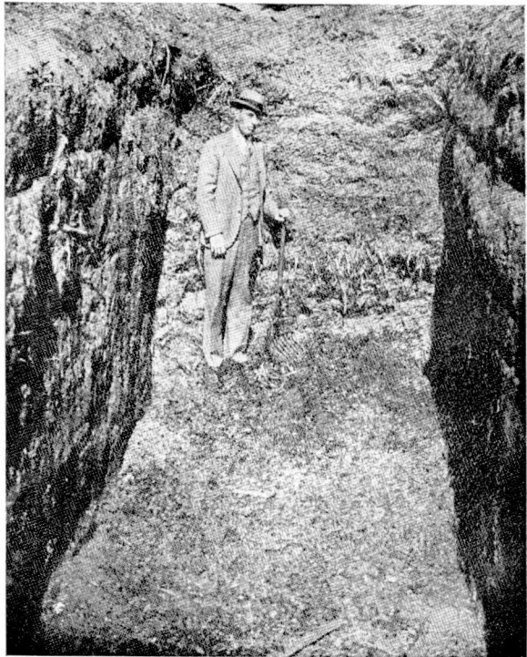
FIGURE 3.—Trench silo on Alabama Experiment Station farm.

Care of the Cutter. —This type of machine is generally weaker in construction than the heavier cutters designed for large units of power and high speed. More care, therefore, is required in its operation to obtain its maximum life and efficiency. The cutter should be oiled about every hour with heavy motor oil or its equivalent. Oiling can be done without stopping the cutter and will take only a few seconds. In case the Babbit bearings are damaged from over-speeding, excessive grit, or lack of oil,