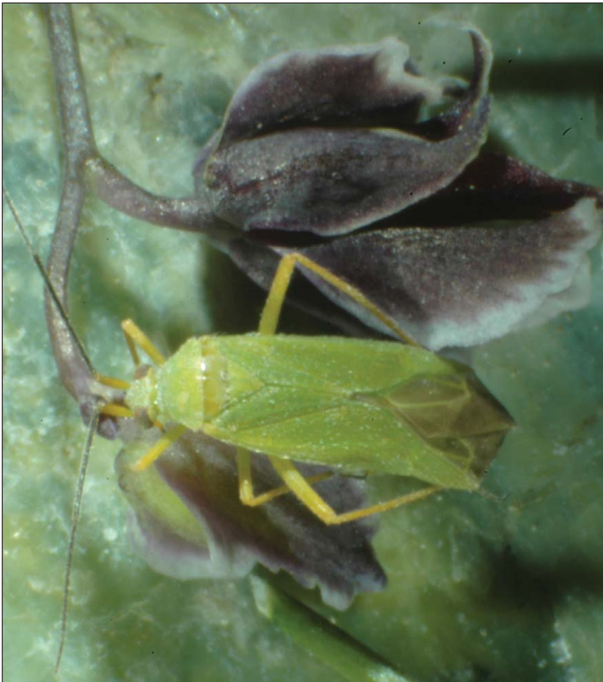
Figure 1. Adult form of the mirid bug Melanotrichus boydi , found only on serpentines in the foothills of California's Sierra Nevada.

Future investigations that add to our knowledge of the serpentine biota are sorely needed. Basic inventories are lacking for many relatively neglected groups of organisms (e.g., bryophytes, insects, lichens, nematodes, protists), and new species likely await discovery in these groups. As an example, Figure 1 and the cover of this Special Issue show photos of Melanotrichus boydi Schwartz and Wall, a new species of mirid bug described in 2001 that is found only on serpentines in the foothills of California's Sierra Nevada (Schwartz and Wall 2001). This species is one of the first discovered "high-nickel insects," species with relatively high levels of Ni in their tissues that are currently known only from serpentine sites (Boyd 2009). Of course, additional information is needed even in better-studied groups, such as the vascular plants, and in relatively well-studied regions such as North