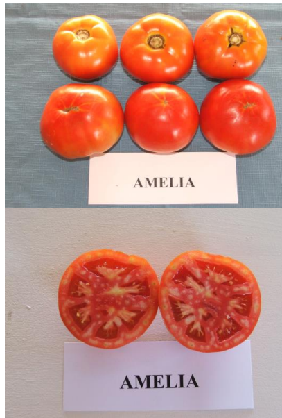
Figure 1. Tomato Varieties Included in Tomato Trials at BARU and NAHRC