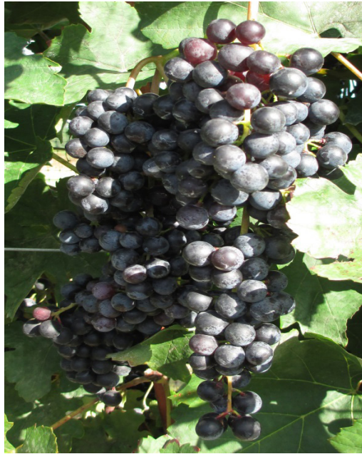
Figure 2. Fruit clusters of PD resistant late season 87.5% V. vinifera selection 501-12, grown at the Chilton REC, Clanton, October 8, 2013.

The preliminary results on the performance of the newly developed PD resistant V. vinifera selections in Alabama are very encouraging. Knowledge gained through this project will aid in development of best management practices and production system recommendations, vital for the establishment of a sustainable grape industry in Alabama and the Southeast.