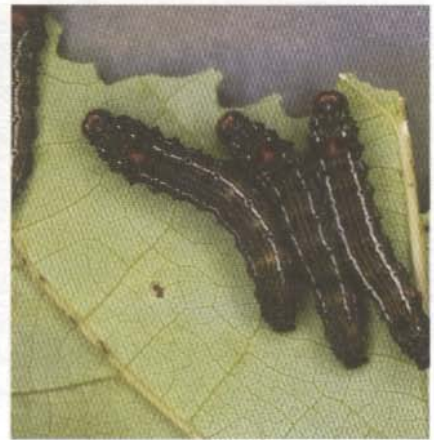
Photo 10 - Early- (left) and late-stage (right) redhumped caterpillars.

Redhumped caterpillars are most commonly found in the Auburn area during August, September, and October. Two broods apparently occur; early stage larvae have been found in late July-early August and again in mid-September, with corresponding mature larvae present about the end of August and again in the last half of October. Typically, infestations have been small and isolated, confined mostly to scattered individual trees. Trees are usually only partially defoliated and damage is mainly aesthetic. However, the species has the potential to produce large populations and cause serious defoliation of landscape trees.