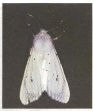
Photo 14 - Black-race fall webworm moths; female and egg mass (left) and male (above).