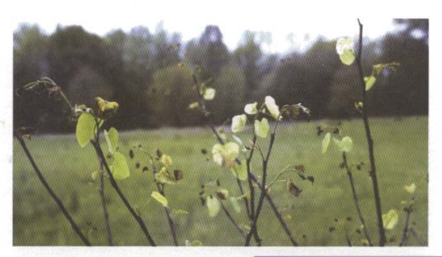
Photo 19 - Young redbud foliage damaged by frost (above) and gall midge (right).

to foliage, and apparently midge activity, ceases by about the end of April; apparently only one brood occurs each year. Overwintering is believed to be as a puparium in the soil beneath trees.