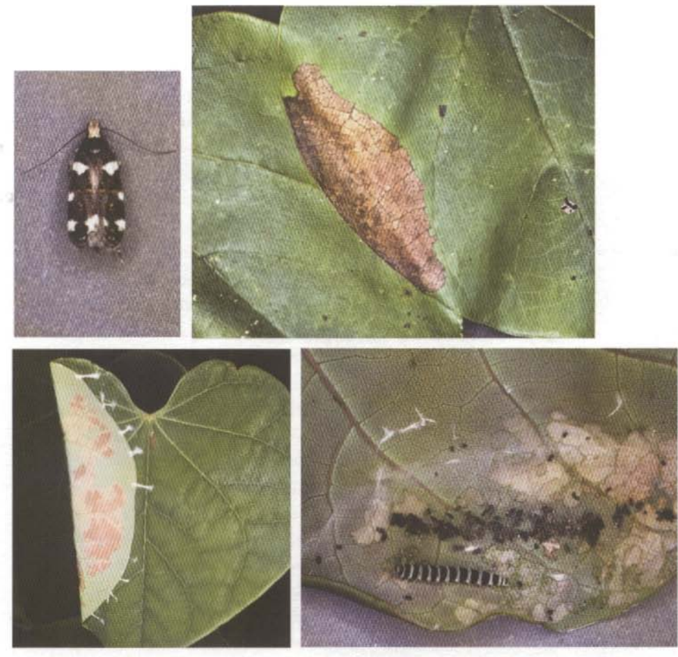
Photo 17 - Redbud leaffolder adult (top left); typical "nests" and skeletonizing damage of redbud leaffolder larvae (top right, bottom left); full-grown leaffolder larva (bottom right).

years, damage to foliage by the leaffolder has not been serious enough to injure trees; however, on small trees, folds and skeletonized areas of leaves become noticeable and reduce the attractiveness of landscape ornamentals.