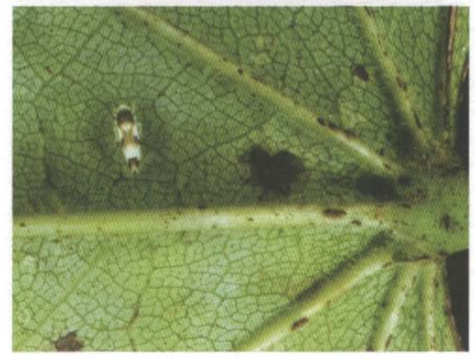
Photo 20 - (above) Redbud leaf with typical leafhopper damage; (below) "Redbud" leafhopper.