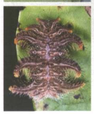
Photo 26 – Urticating caterpillars found on foliage of redbud trees: (clockwise from top left) puss caterpillar (southern flannel moth), Megalopyge opercularis (J.E. Smith); saddleback caterpillar, Sibine stimulea (Clemens); spiny oak slug, Euclea delphinii (Boisduval); stinging rose caterpillar, Parasa indetermina (Boisduval); hag moth larva (monkey slug), Phobetron pithecium (J.E. Smith).