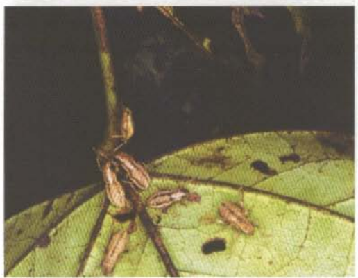
Photo 22 – Broadnosed weevils: (top) fuller rose beetle; (middle) whitefringed beetle; (bottom) Atrichonotus taeniatulus.

mer – they are usually most common on redbud in the Auburn vicinity during August and September. Only one generation occurs each year.