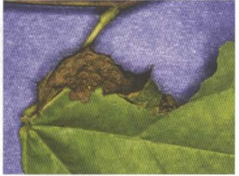
Photo 12 – (left) Early-stage larva skeletonizing leaf; (right) late-stage false unicorn feeding typically at leaf margin. Note how caterpillar appears to be part of the margin of the damaged leaf.