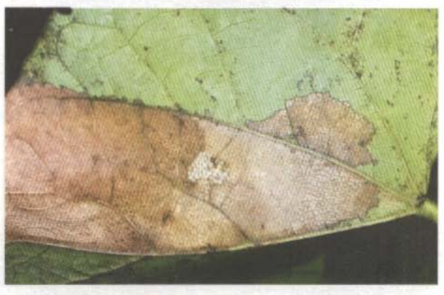
Photo 8, top - Cocoon (left) and adult (right) of the redhumped caterpillar. Photo 9, bottom -Leaf partially skeletonized by newly hatched larvae. Note mass of hatched eggs.

(Photo 10) are tan-orange with black heads. As larvae grow, body color and markings change. Late-stage and full-grown caterpillars (photos 7 and 10) have coral red heads and a conspicuous red hump (the basis for the common name) on the first segment of the abdomen. The body has alternating black and yellow longitudinal lines, a pair of white lines along the margins of the back, and a double row of black spines down the back. The full-grown caterpillar is 30-40 mm long. Full-grown caterpillars leave foliage and spin cocoons in plant debris or soil.