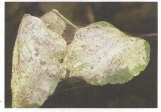
Photo I5 - Skeletonizing (above) and webbing (below) of leaves typical of early stage webworm larvae.