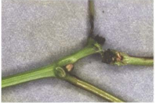
Photo 18 - Typical gall formed by the midge at the base of redbud leaf petiole (above); open gall showing signs of larval feeding (below).

ferred, possibly only, host tree. Following discovery of the gall at Auburn, a similar, or same, gall on the petiole of redbud has been reported from West Virginia<sup>8</sup>. Larvae from the galls have been identified to genus Dasineura. It seems possible, even likely, that the midges from the two localities may be the same, so the Auburn midge is tentatively identified also as a species of Dasineura.