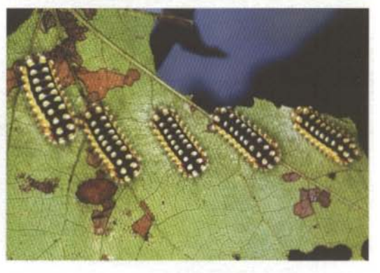
Photo 5 - Newly hatched larvae skeletonizing the lower surface of redbud leaf. Photo 6 - Group-feeding typical of early and mid-stage N. ovina larvae.