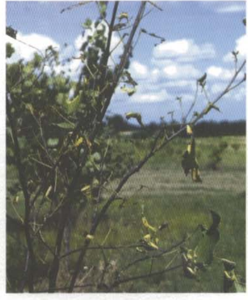
Photo I- Redbud infested with white flannel moth larvae; larvae are about full-grown.

The white flannel moth, Norape ovina , is one of the most destructive leaf-feeders identified in the study. In 1993, an infestation occurred in a planting of redbuds at the state hardwood tree seed orchard in Lee County near Auburn. Caterpillars were numerous and small trees were completely defoliated (Photo 1). The species and its activities in Alabama were unknown before this time; consequently, a study of the insect, its life history, habits, and potential as a pest of redbud began and continued through subsequent years 1994-98. Findings are as follows.