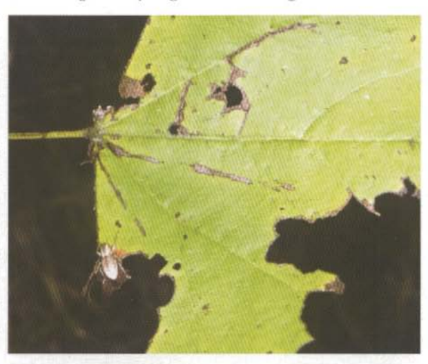
Photo 21 - Redbud leaf with typical damage caused by broadnosed weevil adults.

leaves and progresses to partially or completely destroy all but the midrib and larger veins (Photo 21). Adults are similar in form, each with the short, broad "snout" typical of the group. The fuller rose beetle (Photo 22, top) is brown and 7-8 mm long; the whitefringed beetle (Photo 22, middle) is about 12 mm long, and dark gray with white stripes along the sides and on the dorsal surface of the head and thorax: A. taeniatulus (Photo 22, bottom) is black with gray scales, and about 5 mm long.