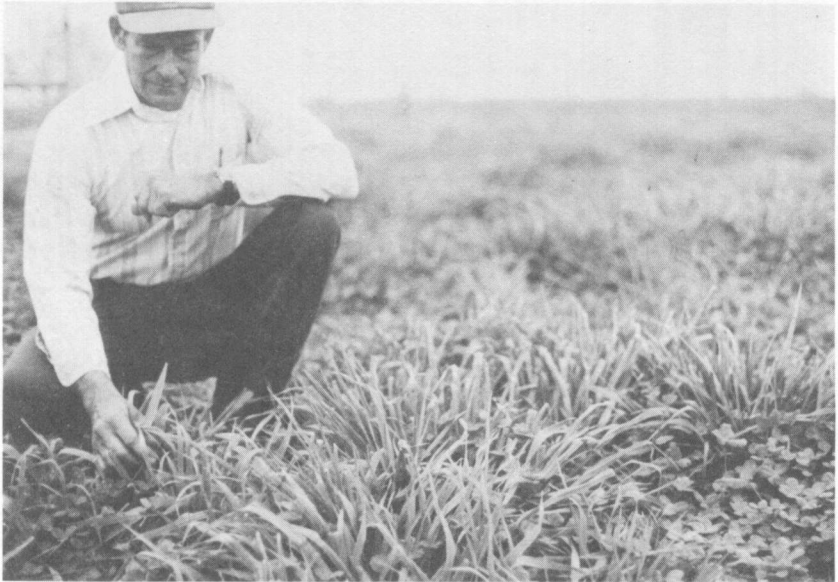
FIG. 2. Good ladino clover in Oasis phalaris pasture at Black Belt Substation (April 2, 1979).

Oasis phalaris is a bunch-type grass and competes less severely than tall fescue with legumes. Clover grows well with phalaris, figure 2.