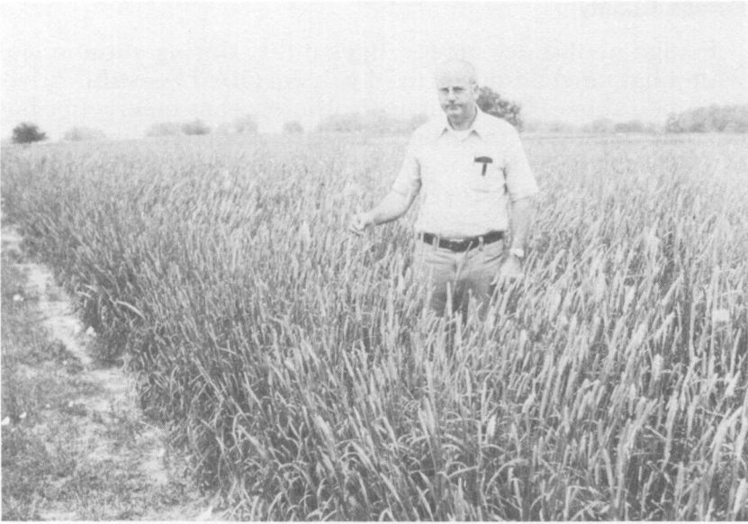
FIG. 3. Oasis phalaris with seed heads (Black Belt Substation, May 9, 1974).

root corms, especially with high nitrogen fertilization, can be reduced by 50 percent with late spring and summer defoliation (10). Thus, to achieve its high autumn and winter yield potential, grazing pressure on oasis phalaris should be reduced during heading, figure 3.