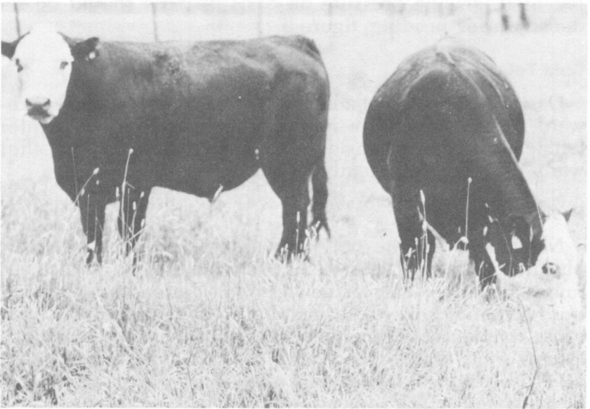
FIG. 4. Beef steers in excellent condition near end of grazing season at Black Belt Substation (June 2, 1978).

Beef steer performance on Oasis phalaris has been good, figure 4. In a 3-year grazing trial at the Black Belt Substation, the average daily gain of steers was 1.73 pounds and beef gain per acre was 347 pounds (6). The average daily gain obtained on phalaris is similar to that obtained on high quality small grain pastures.