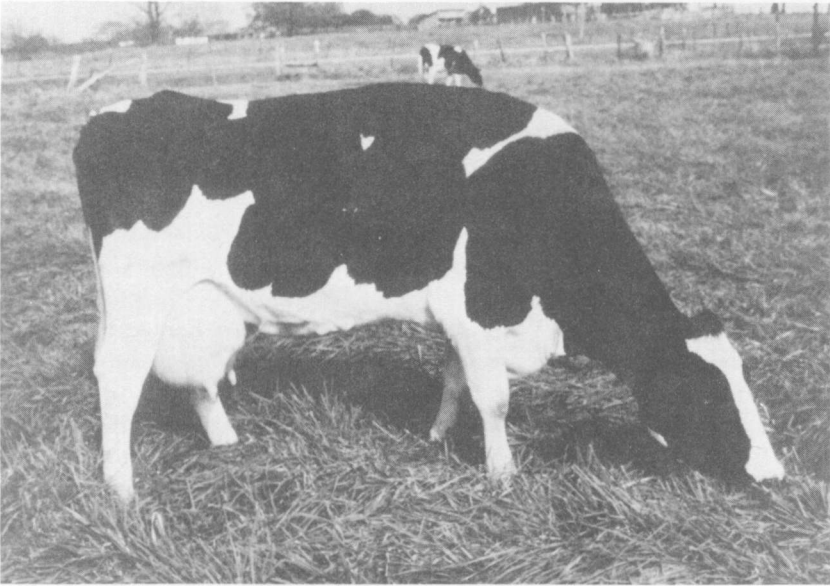
FIG. 5. Good quality autumn grazing is available to dairy cow at Black Belt Substation (Nov. 12, 1975).

Oasis phalaris has been particularly useful for dairy cow pasture since it furnishes high quality forage in early autumn when no other high-quality pasture is available, figure 5. It is cheaper to grow than winter annuals and produces a firm sod to reduce "pugging" by cattle during wet weather.