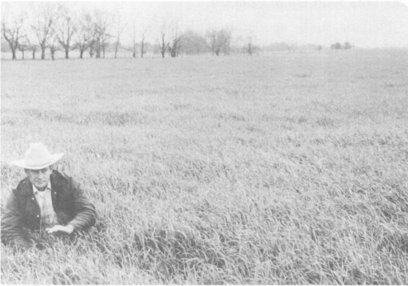
FIG. 1. Excellent winter forage growth of Oasis phalaris at Black Belt Substation (March 13, 1981).

Oasis phalaris has been superior in autumn production to Wintergreen phalaris, developed in Texas, and Ky-31 tall fescue, table 2. Autumn forage production of Oasis phalaris is especially advantageous since high-quality grazing can supply the needs of dairy cattle and growing beef calves when small grain pasture is not available.