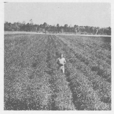
Fig. 1. A field of Warrior vetch grown for seed production in a field following cotton. Cotton stalks serve as an excellent support for vetch.

Experience has shown that to obtain good vetch seed yields it is desirable to have a support, such as cotton stalks, grain sorghum stubble or rye, Figure 1.