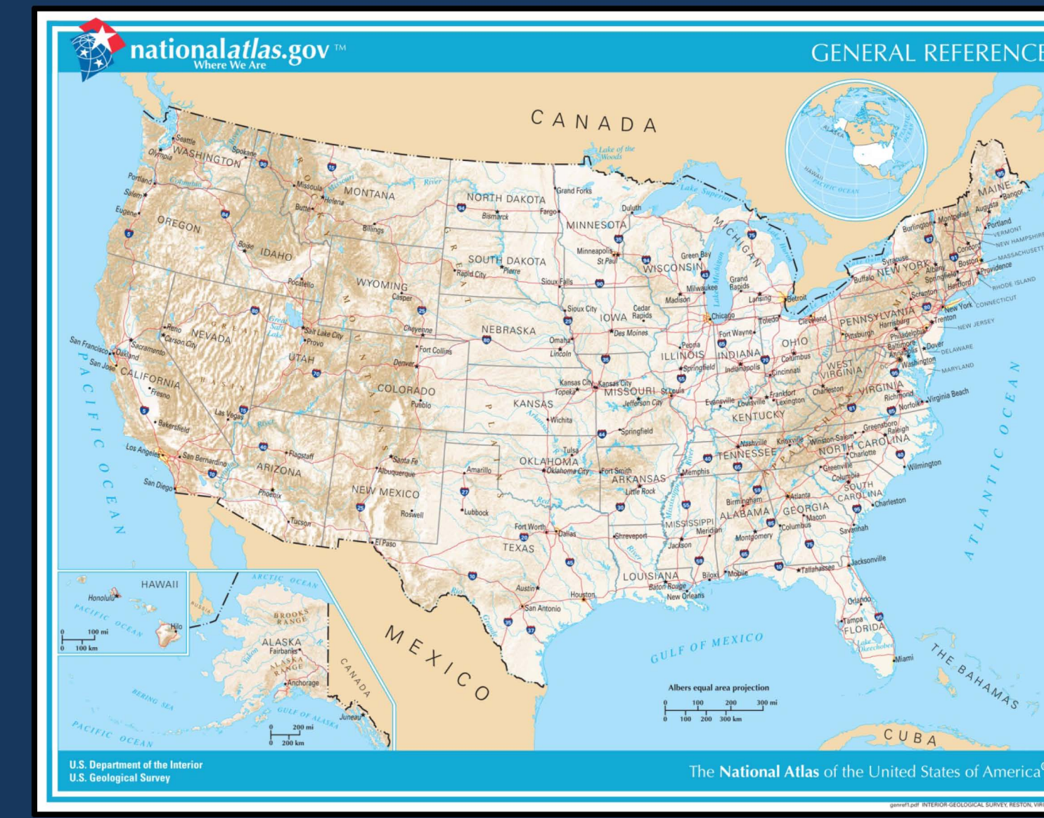
USA Users (minus Alabama Users)

... made 3.6% of all 2012 visits ... viewed 5.57 pages/visit (avg.)