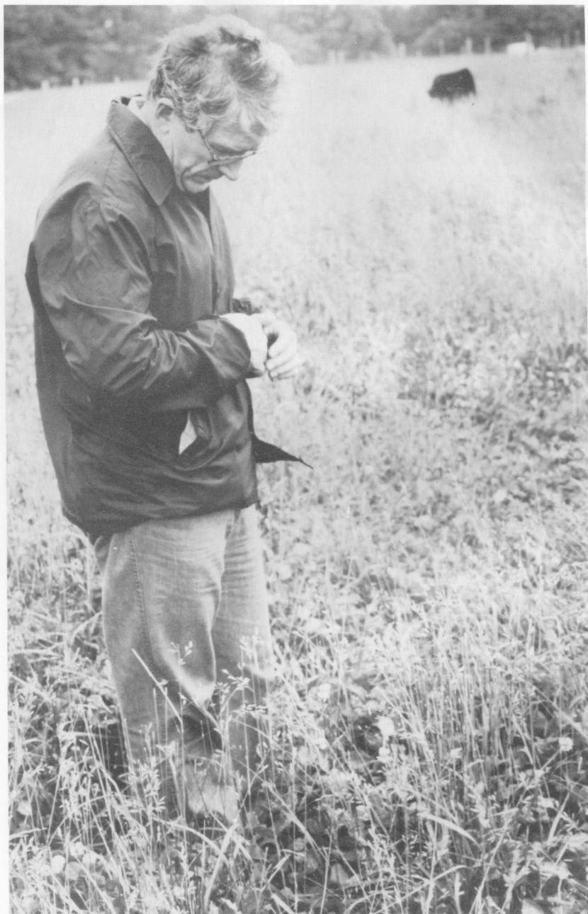
FIG. 3. Understocked tall fescue-ladino clover pasture, April 24, 1979, that was cut for hay.