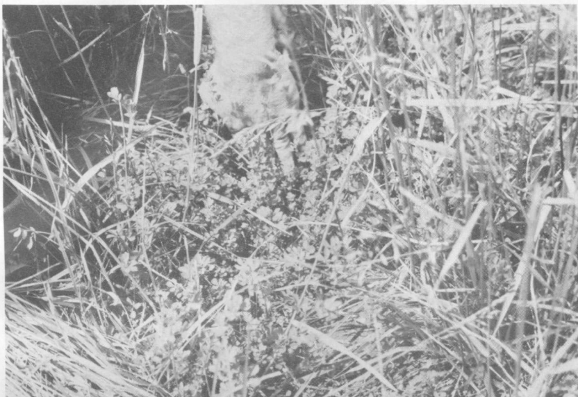
FIG. 1. Sparse amount of Fergus birdsfoot trefoil in tall fescue pasture.