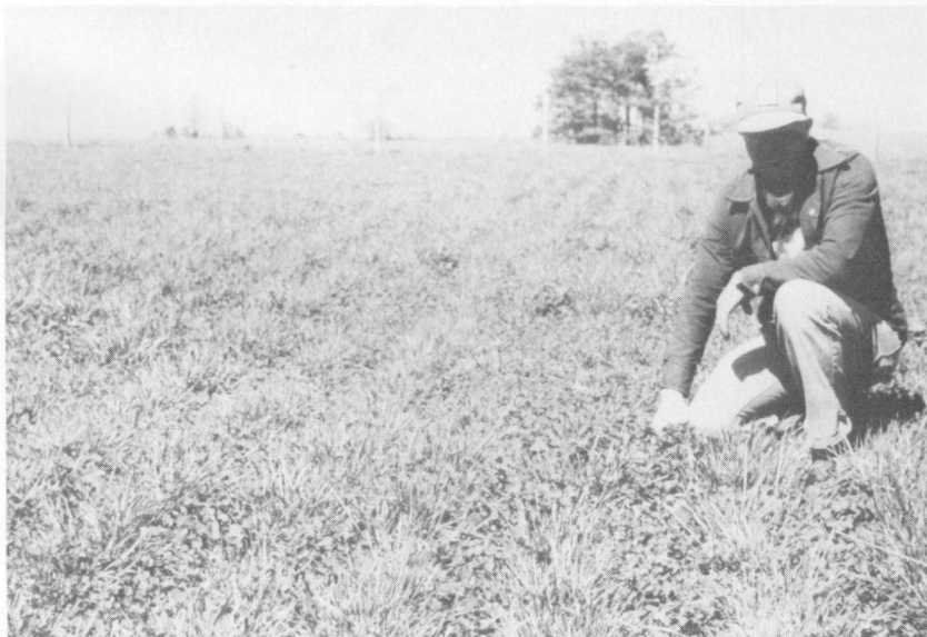
FIG. 2. Thick stand of Regal ladino clover in tall fescue pasture.