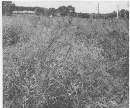
FIG. 3. Warrior vetch grown for seed in cotton stalks on the Main Station is shown above. Photo shows growth in May 1957.

In the fall of 1956, tests were begun to determine relative seed yields and bruchid resistance of Warrior and hairy vetch. With the exception of one year at the Alexandria Experiment Field, cotton stalks were used as support for the vetch, Figure 3. At Alexandria in 1956-57 rye was used. All experiments were replicated 4 to 5 times in a random pattern. Seed were threshed with a stationary thresher. Bruchid infestation was determined 6 to 8 weeks following seed