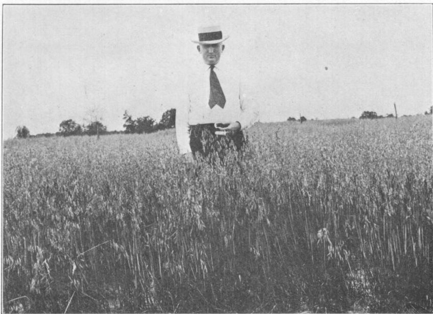
Figure 2.—Oats fertilized with 100 pounds of nitrate of soda per acre made 38.4 bushels per acre. (Plot 8 Cullars Rotation Experiment. Photographed May 9, 1923.)

land; the area used is less productive than average Norfolk soil.