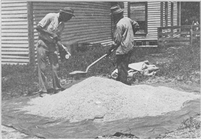
Figure 7.—Oats being treated with formaldehyde to prevent smut.