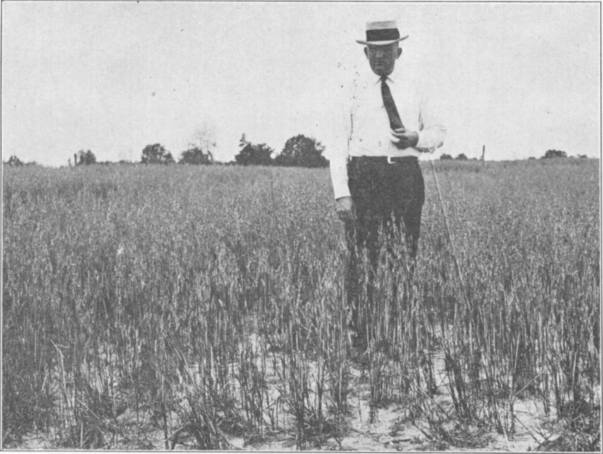
Figure 1.—Oats without fertilizer made 18.4 bushels per acre. (Plot 7 Cullars Rotation Experiment. Photographed May 9, 1923.)

The amount of ground limestone required to correct the acidity from 100 pounds of each of these materials is as follows: ammonium sulfate, 120 pounds; urea, 133 pounds; and leunasal-peter, 113 pounds.