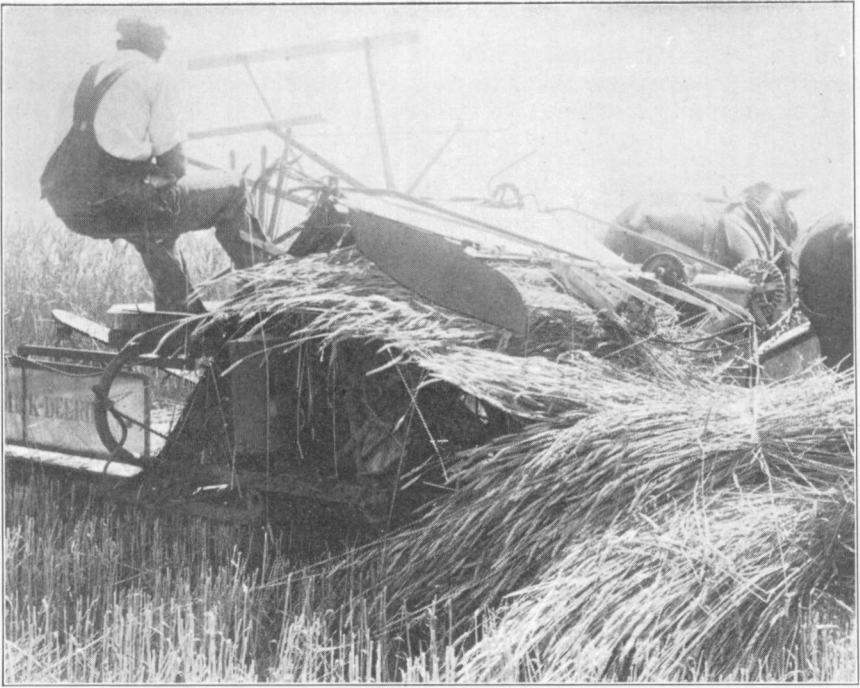
Figure 5.—Cutting wheat at Auburn with a six-foot binder. A machine like this should cut about ten acres of grain per day. (Photographed June 1, 1931.)

per day. A binder of this size is too heavy for two mules and should be drawn by three or four if a full day's cutting is to be done.