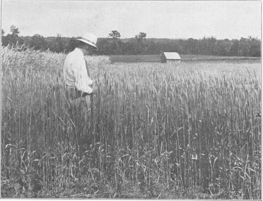
Figure 4.—Alabama Bluestem wheat at Auburn which made 42 bushels per acre. (Photographed May 7, 1931.)