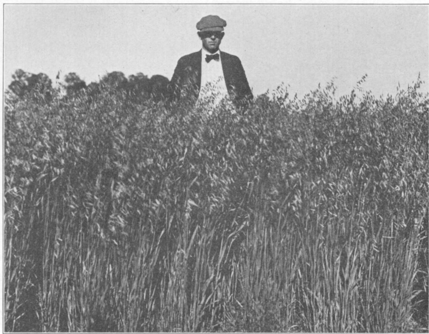
Figure 3.—Oats fertilized with 468 pounds of nitrate of soda per acre made 68.4 bushels per acre. (Plot 3 Cullars Rotation Experiment. Photographed May 9, 1923.)

There was little difference in the yields of the Red Rustproof, Fulghum, and Appler varieties during the period from 1922 to 1931, inclusive.