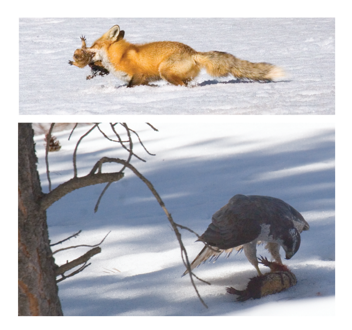
Figure 1: Top , red fox on April 8, 2005, just after capturing adult male R12, who lived at the periphery of the study colony. Bottom , northern goshawk on April 7, 2005, in the process of killing adult male R44, who had immigrated into the study colony on April 5, 2005.

Figure 2 supports the hypothesis that juvenile Utah prairie dogs should be more vulnerable than adults to predation. From the emergence of the first litter on June 6, 2005, until our last day of observations at the study colony on