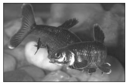
Battling minnows make distinct sounds of aggression.

The AU Board of Trustees in September approved $3 million in funding for the Auburn Alternative Fuels Initiative, a new effort aimed at reinvigorating Alabama's existing natural resource–based indus-