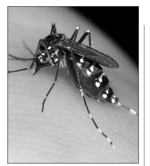
Insecticide-resistant mosquitoes can transmit a wide range of diseases.