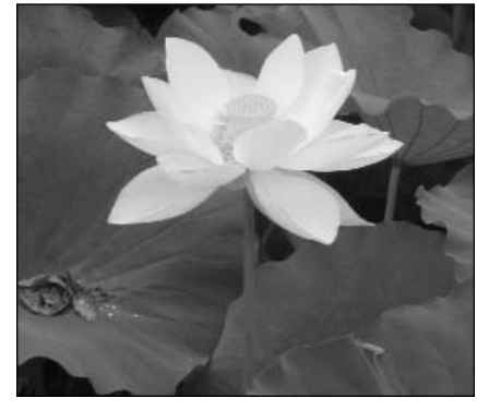
Lotus, an aquacultural crop, could be the perfect selection for the Black Belt's poorly drained soils.

In the first phase of the lotus project, researchers from AU and Alabama A&M, along with scientists from Mississippi State, the University of Georgia, China and Japan, will work to determine the market appeal of and demand for lotus products, evaluate lotus' eco-