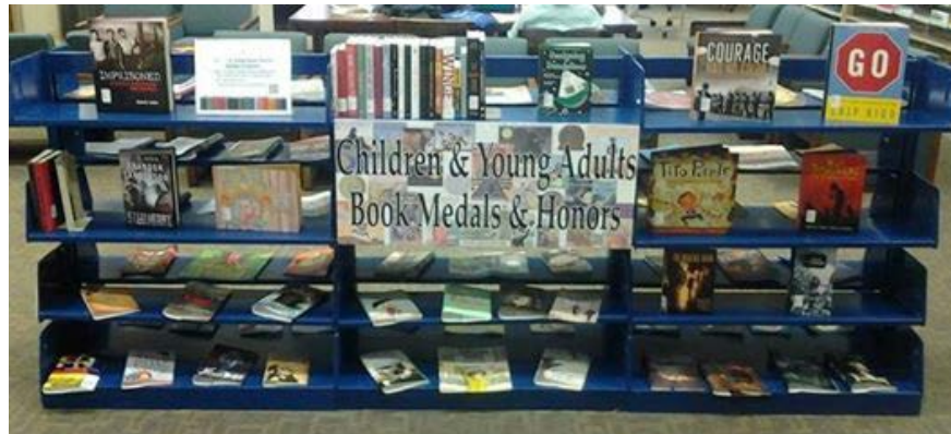
Figure 1 Children & Young Adult Book Display in the Library Main Lobby

The first step for promoting the newly acquired books was a special book display located in a space near the main entrance to the library. The Marketing and Public Relations office in the Libraries printed and mounted a new colorful sign to promote the display and to inform patrons that the books were award-winning children's and young adult books. For additional visual appeal, the dust covers from the new books were kept and some of them were used to in the display for decoration. Since the artwork on many dust covers was not presented on the book covers, this allowed patrons an opportunity to appreciate them.