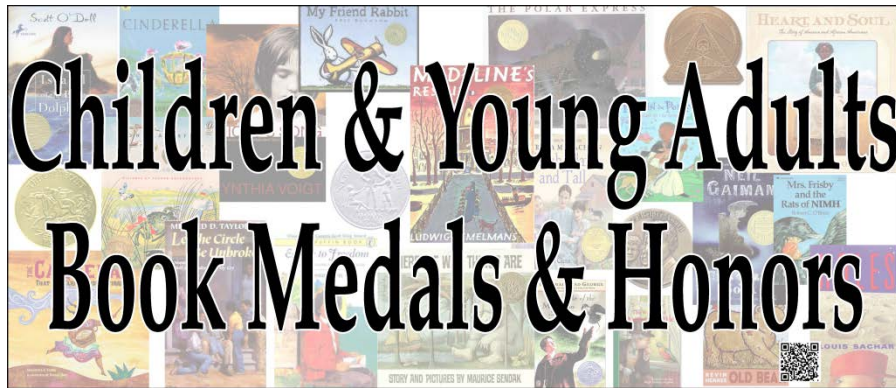
Figure 2 Sign for Children & Young Adult Book Display in the Library Main Lobby

The dust covers also helped patrons to have a better visual recollection of the titles in the display, especially in cases where the book itself may have been checked out at the time. The book display remained in that location for the duration of the academic term. Then the books were relocated to the juvenile collection.