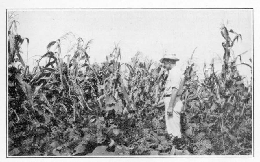
FIGURE 4.—Showing growth of corn after kudzu on Cecil clay soil near Dadeville, Alabama. Kudzu was plowed up in spring of 1939 and planted to corn. Note unplowed kudzu in foreground. Photographed August 1939.

The results show that in 1919 and 1920 sorghum following kudzu produced 2,536 pounds of hay per acre more than that not following kudzu. The average yield of 4 crops of corn following kudzu was more than double the yield on the plot that had not grown kudzu. The average yield of 7 crops of oats on the kudzu plot was 7.9 bushels per acre more than that on the plot which had grown no kudzu. In 1929, 10 years after the kudzu was turned under, the kudzu plot produced 9.2 bushels of oats per acre more than the plot on which kudzu had never grown.