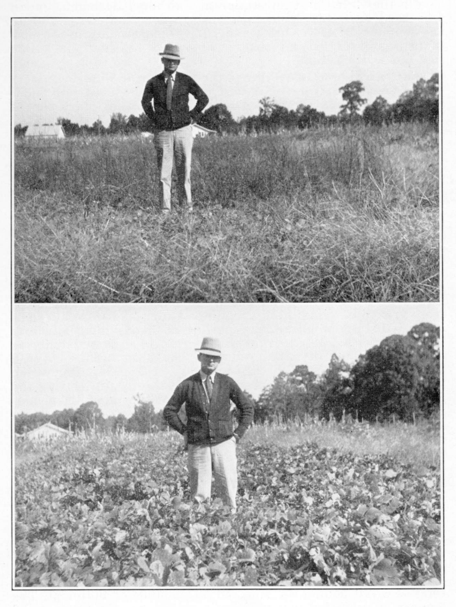
FIGURE 3.—Showing the effect of cutting kudzu the wrong time of the year. Above, cut in June and August. Below, cut in June and November. Notice the growth of broom sedge above.