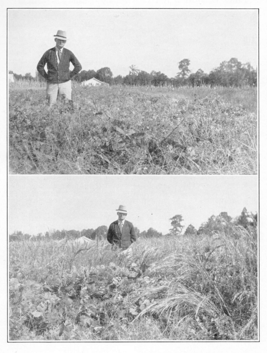
FIGURE 2.—Showing the effect on the stand of kudzu from cutting too frequently from 1934 to 1938, inclusive. Above, cut once each year. Below, cut 3 times each year. Note the growth of broom sedge on the plot below. The stand on this plot was so thin that it was not cut in 1939.