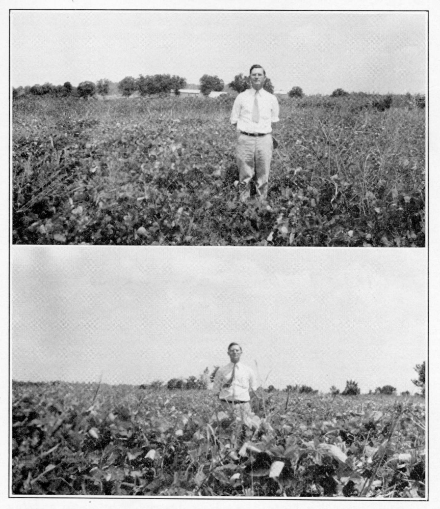
FIGURE 6.—Showing the effect of phosphate on the growth of kudzu on Decatur clay soil. Above, unfertilized. Below, 800 pounds of basic slag.

On poor soils and soils of average fertility, kudzu should receive a good application of manure or an application of 600 pounds of basic slag or 300 pounds of superphosphate per acre every 3 years. The fertilizer should be applied before growth begins in the spring and the area disked or plowed.