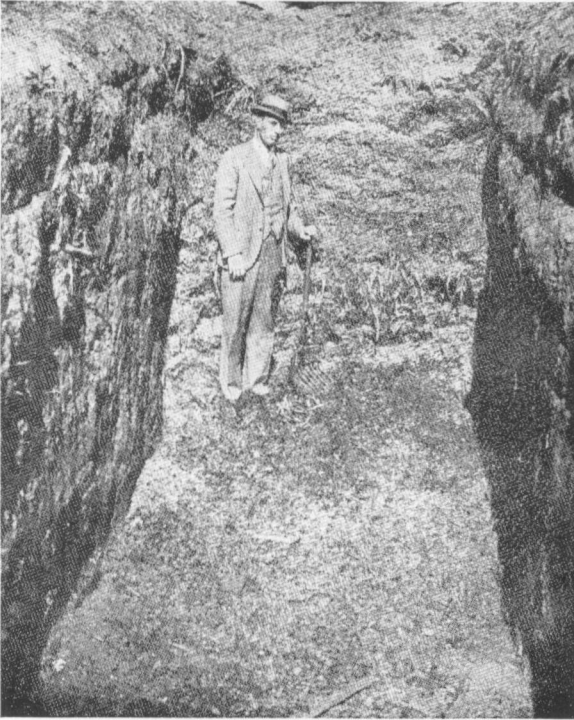
FIGURE 1.—Trench silo on Alabama Experiment Station farm.

there is no reason why it should not be built in a pasture some distance from the barn. The silage can be hauled to the barn daily and fed, or troughs can be built near the silo and the cows fed there any time during the day.